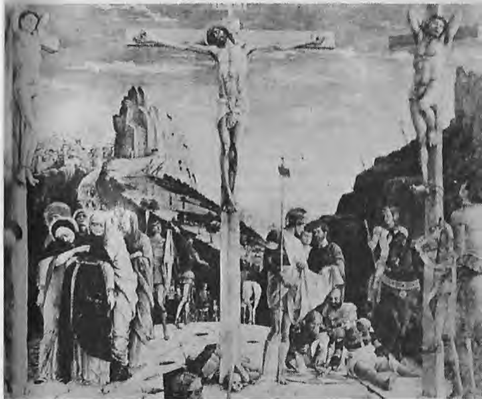
"Without crucifixion with Me there is neither mercy nor heaven in eternity."

this union in sacrifice and in My passion, that is when He sheds abundant graces of forgiveness and mercy. And sacrifice is very, very urgent!... in order to shed a certain torrent of graces that you all need, and they are not granted through lack of sacrifice, of penance, of crucifixion. As I surrendered Myself to suffering from the moment of My Incarnation, thus you should all surrender yourselves, absolutely all of you. Because those who withdraw from the suffering of the Cross cannot be with Me, and Divine Justice cannot admit them to the retinue of My Redemption. This is what I ask, and you need to offer yourselves as victims for those who withdraw from the doctrine of the Cross.